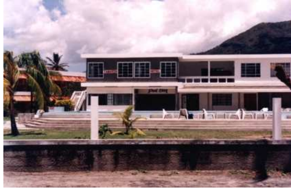
Tamarin Bay Hotel

The ambulance came screaming in with its headlights sweeping the carpark, did a U-turn in front of the hotel, and took off again! The ambulance driver was from a black hospital, so when there was no one at the front of the Chinese hotel to collect he obviously thought he had his instructions wrong.