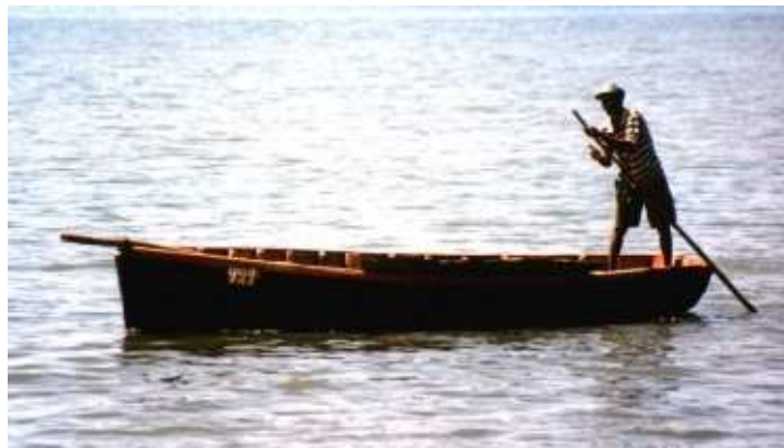
Wooden boat in Mauritius

My two friends lifted the boat over the reef with me in it. It was ripping the bottom. It was a wooden boat, and the boat was their livelihood, so I knew the situation was very serious for them to be doing that. They lifted the boat over into the lagoon and were swimming, trying to push the boat to get it going. I said, “Come with me!” But they replied, “No, it’s too heavy, get the young boy to take you ashore”. So this young kid was pushing the boat to shore with a pole.