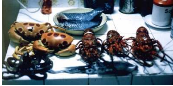
A typical seafood harvest

After surfing my heart out on Tamarin's very fast left-hand reef break for several weeks, I was running out of money. So I headed to South Africa where I found a job teaching windsurfing and water-skiing. Amazingly they actually paid me to do this! I surfed Jeffrey's Bay and Elands Bay and visited some of South Africa's world famous wildlife reservations.